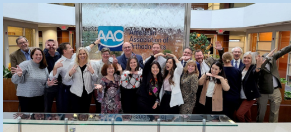
Members of the RMSO and MSO Leadership Teams